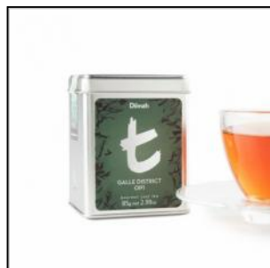
t-Series Galle District OP1