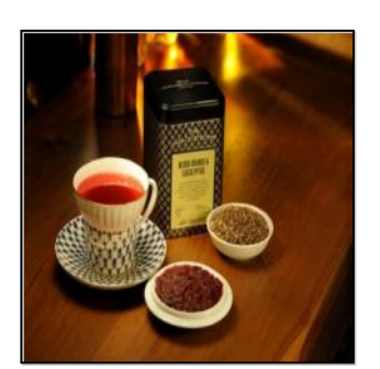
Silver Jubilee Blood Orange & Eucalyptus