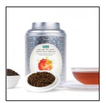
Vivid Ceylon Tea with Apple Pie & Vanilla