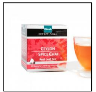
Exceptional Ceylon Spice Chai